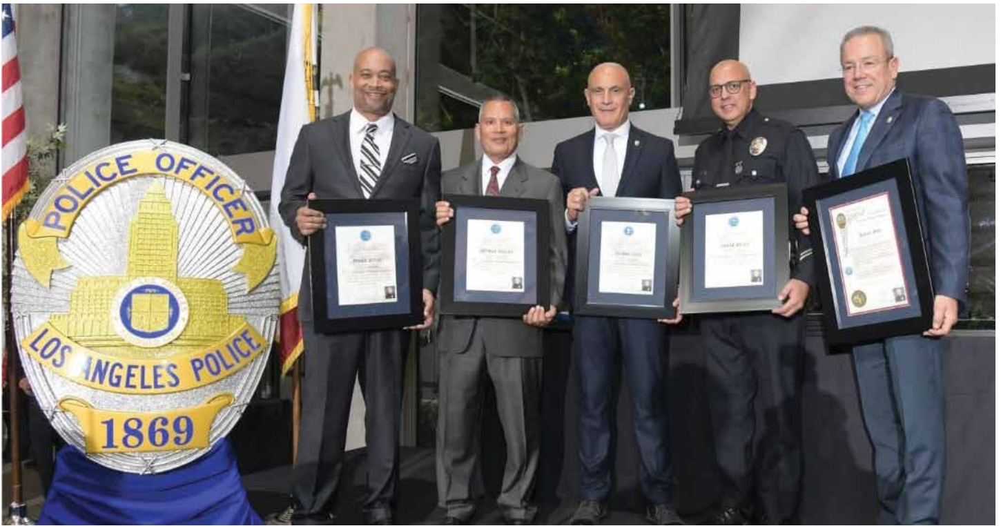
West Bureau Reserve Officers of the Year