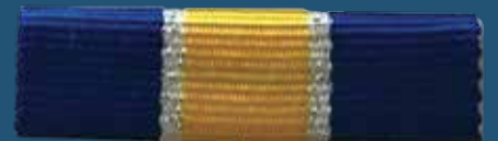
The Reserve Exceptional Service Ribbon; top to bottom: Department, Bureau and Area/Division