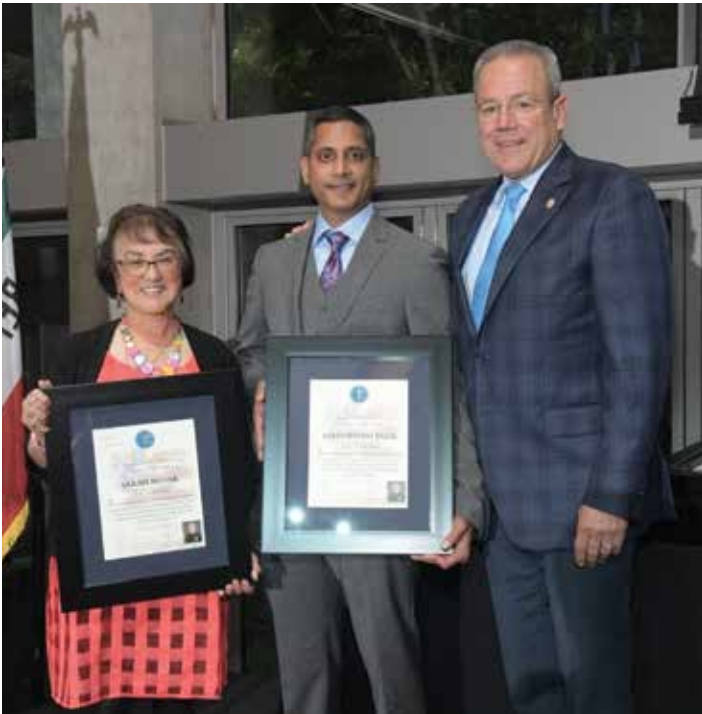
Central Bureau Reserve Officers of the Year