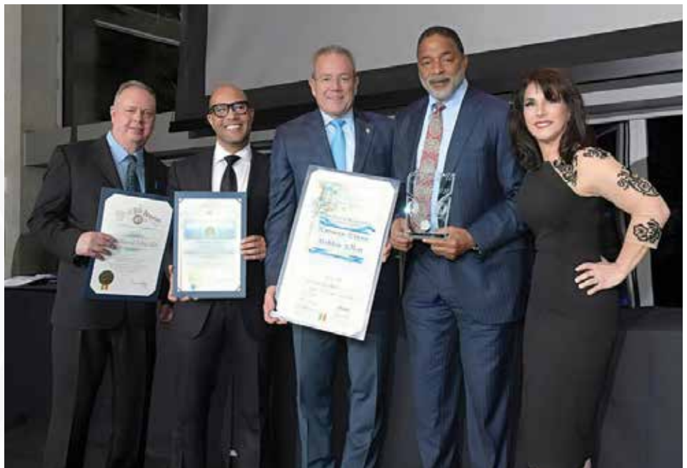
Twice a Citizen community honoree Norman Nixon (second from right)