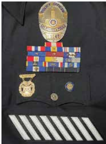
The author's full ribbon rack showing all 16 of his awarded ribbons, with hash marks for reference.

The Police Commission Integrity Medal had been pulled and is now defunct. The medal was developed after the Rampart scandal, and it was hoped that it would encourage officers to report wrongdoing on the Department in order to keep corruption out of the ranks. They even used the Medal of Valor design, except they changed the word "Valor" to "Veritas" (Truth). The problem was that to qualify, the information provided by the recipient had to result in fellow employees being brought to justice. It quickly became known as the "Rat Ribbon" and nobody wanted it. This author's