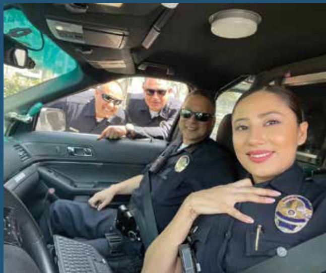
High-visibility patrol by LAPD reserve police officers in West Bureau during Easter/Passover 2023. See page 30 for additional photos.