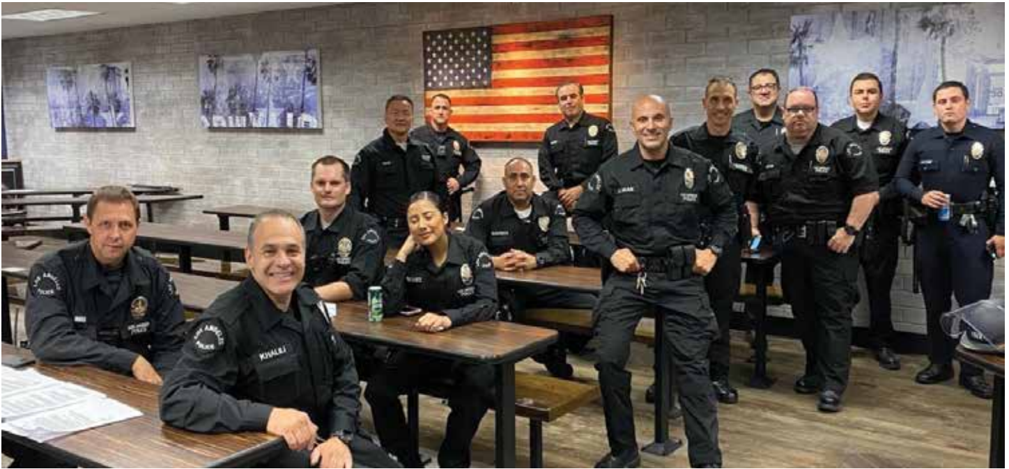
HWD reserve officers in the roll call room

crisis to having our entire profession vilified and blamed for a tragedy that happened 1,500 miles away. After the Department was mobilized, I personally worked 18 days straight with very little sleep in between shifts. These were long, grueling and depressing days. If an officer was lucky enough to find themselves on a short break from the skirmish line and made the mistake of looking at any form of social media, they would have been instantly confronted by antagonistic, anti-police posts by everyone from celebrities to childhood friends and even family members, all piling on and calling for the abolition of our entire profession. We were under attack from all sides, both literally and figuratively. Personally, by day four or five, the only thing keeping me going was the running tally in my head calculating the number of overtime hours I had accrued so far in the mobilization and my predictions for what that next paycheck was expected to be. To my astonishment, nearly all of my reserve officers at Hollywood volunteered to work during the riots, and not in some ancillary, cushy, fixed-post assignment, either. Reserves held the line