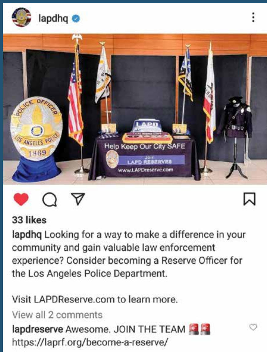
LAPD Headquarters highlighted the lobby display for Reserve Appreciation Month on social media in April.