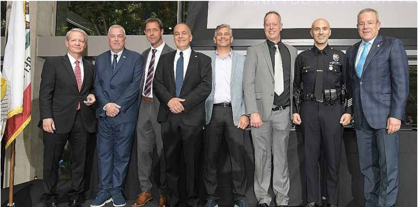
Reserve officers receiving service pins