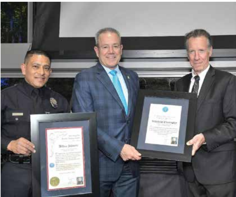
South Bureau Reserve Officer of the Year