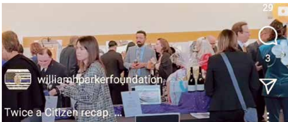
Screenshot of the William Parker Foundation Instagram Reel of the Gala, set to "Unstoppable" by Sia