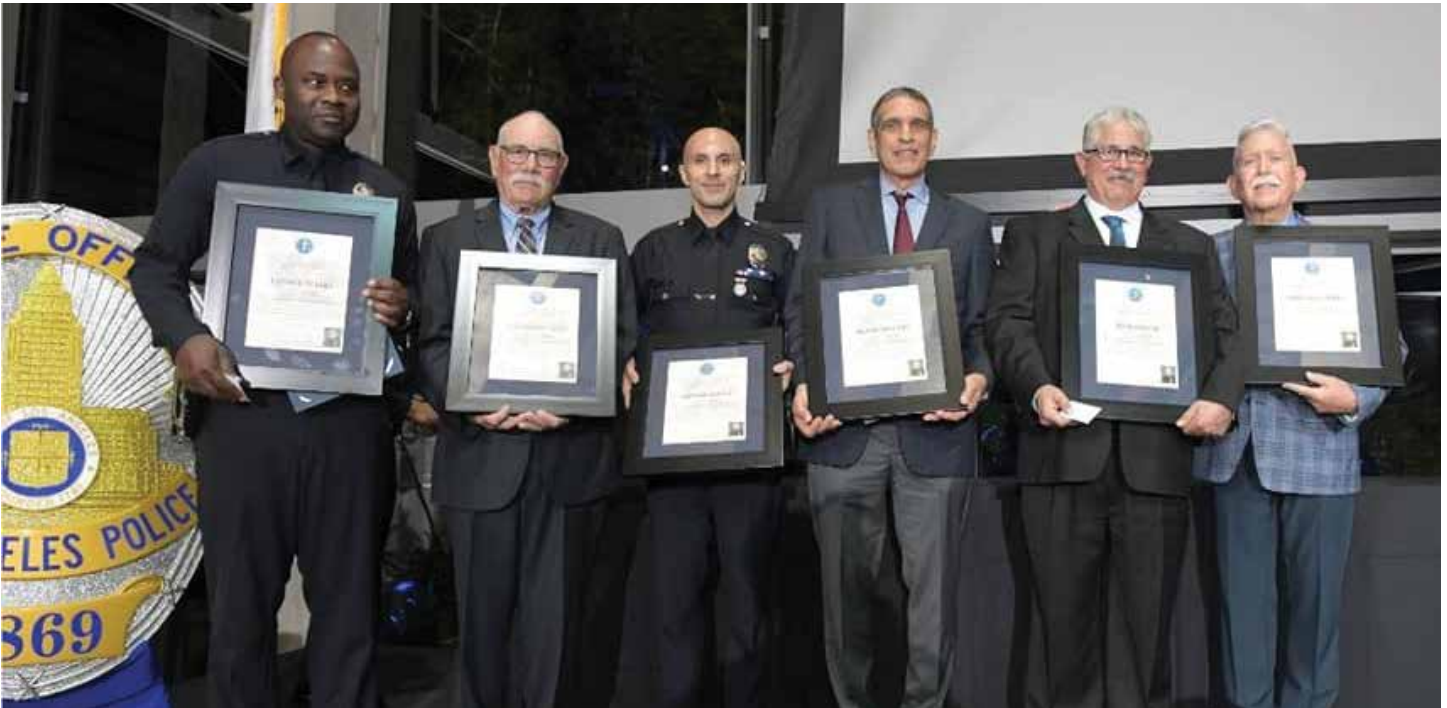
Specialized Divisions Reserve Officers of the Year