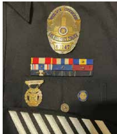
Many times, wearing all the ribbons looks like too much bling on the daily uniform and officers will drop the lesser ones off. This is the same rack, but with the event ribbons removed.

understanding is that it was actually awarded a few times, but officers did not want to accept it. Because of its unpopularity, the medal was removed. Of note, you can still find them on eBay, falsely promoted as an early-model Medal of Valor.