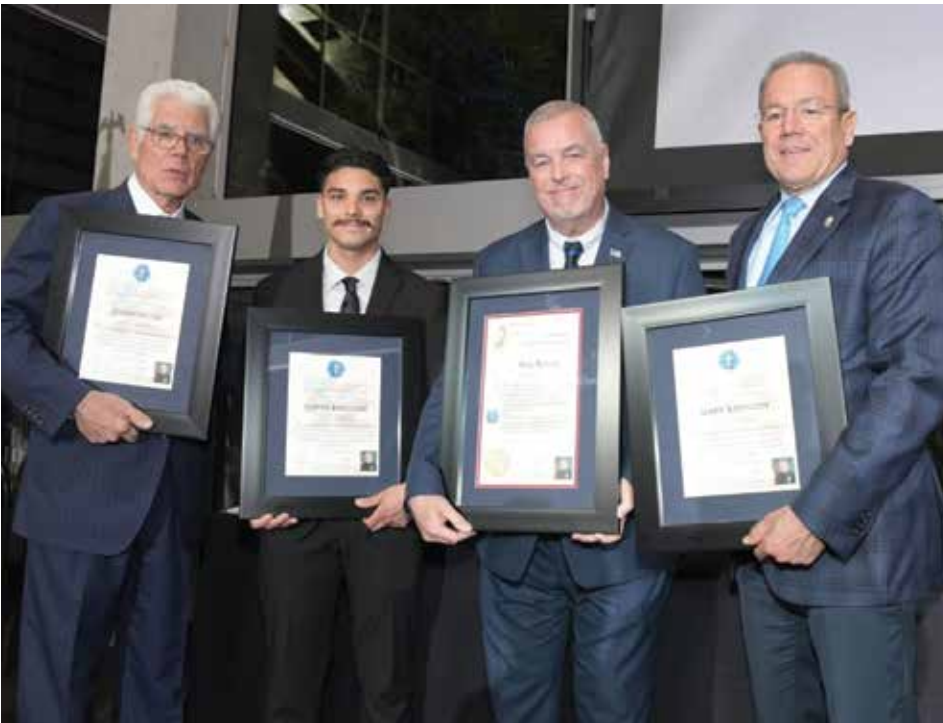
Valley Bureau Reserve Officers of the Year

a Golden Globe, five NAACP Image Awards, a Drama Desk, an Astaire Award (for Best Dancer) and the Olivier Award. Ms. Allen holds four honorary doctorate degrees and has a star on the Hollywood Walk of Fame. She was appointed by President George W. Bush to represent the United States as a Cultural Ambassador of Dance. She has been artist in residence at the Kennedy Center for over 15 years, creating original works with the legendary Arturo Sandoval and James Ingram. She is currently an executive producer as well as a director and actress on ABC's Grey's Anatomy , as well as artistic director (and founder) of the Debbie Allen Dance Academy." Ms. Allen was unable to attend the Gala.