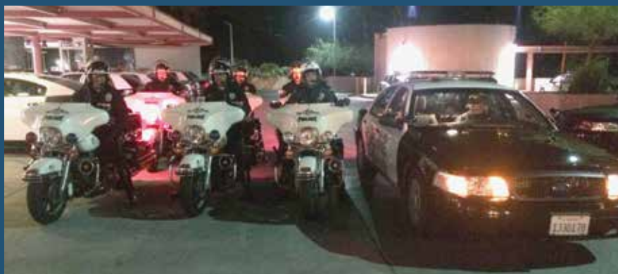
Reserve Crime Suppression Task Forces: at roll call in Mission Area on November 15, 2013, and in North Hollywood Area on April 11, 2014. Thanks to all the officers who participated. ☺