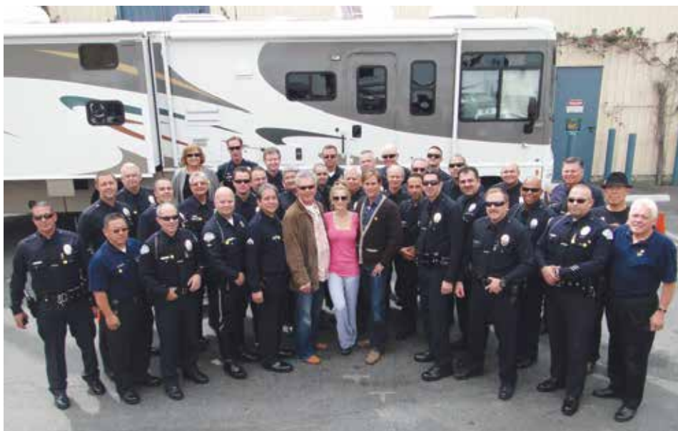
LAPD Reserve police officers at Raleigh Studios, during the Sunshine Kids event.

Thank you to the Los Angeles Police Reserve Foundation for their financial support for all of these worthy events. 🙏