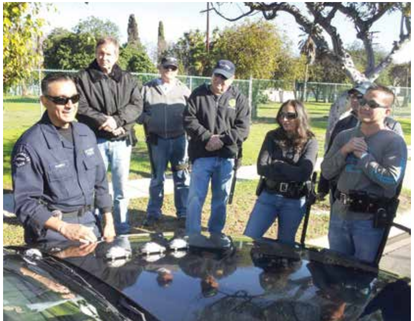
Officers go over mobile tactics before practicing at the field training site near ATC. The day started at 0600 hours.