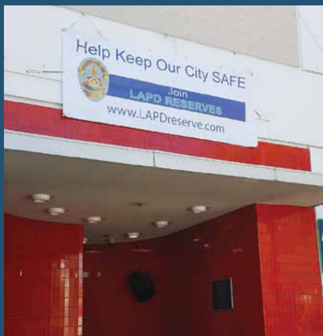
A new reserve recruitment banner at West Los Angeles Area Station. The Foundation has funded banners for all area stations, as part of the Department's efforts to ramp up reserve recruitment.