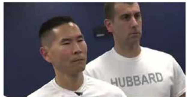
Surgeon Trades Scalpel For Glock In LAPD Reserve Training