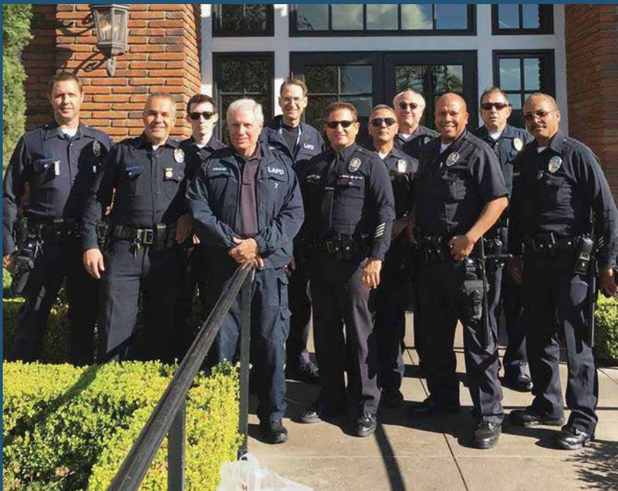
LAPD reserve police officers working at the Grove in November. Few people realize that the officers protecting and serving in many of these special task forces are members of our LAPD Reserve Corps.