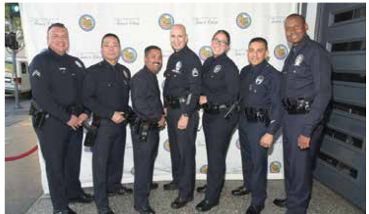
The ROVU Unit