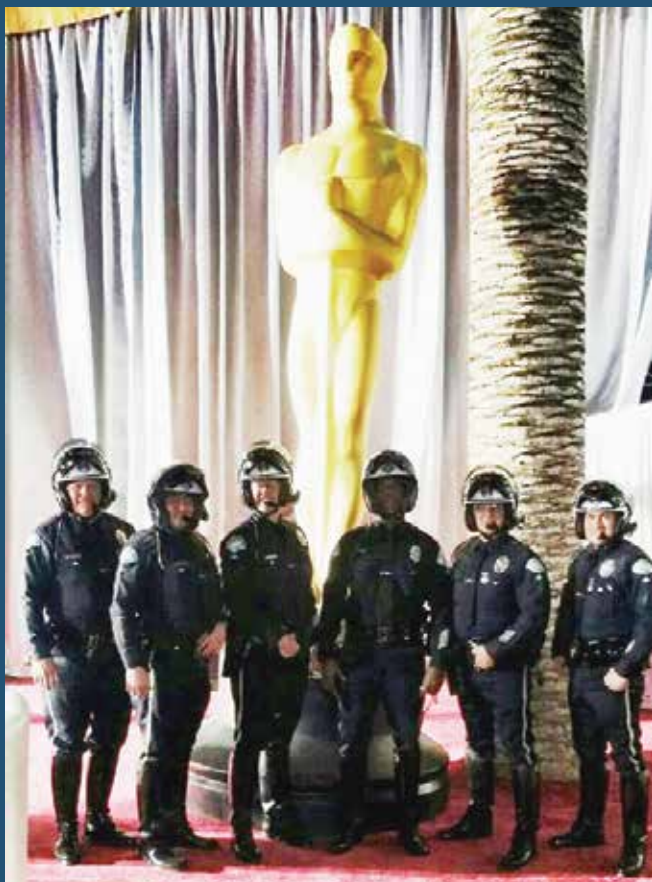
LAPD Reserve Motors working the red carpet at the Academy Awards ceremony in Hollywood in February