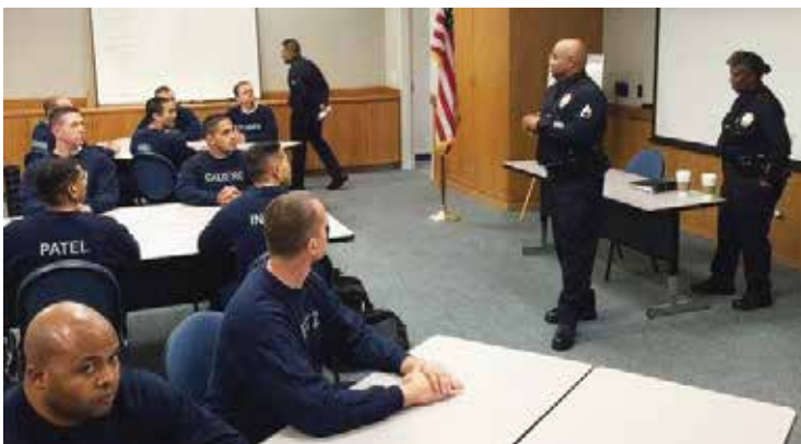
The first Level I Academy since 2009 began on May 15.

Each day I come to work, I am inspired by all the stories that I hear about your hard work. Reserves are individually and collectively making a difference in all the communities of Los Angeles. Recently, ROVU sent out several emails requesting reserve officers to help in a variety of assignments. Many of you have responded and volunteered to work those details. I want to thank you. Your actions are making a difference, and command officers are asking almost weekly for reserve officers to help supplement their commands.