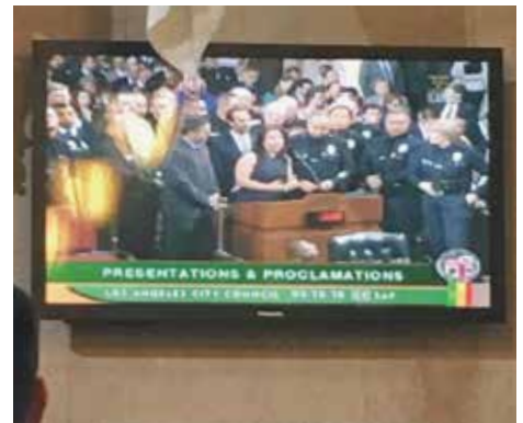
The video monitor in the Council chambers during the presentation

Pictures of the Reserve Officers of the Year and service pin presentations at the banquet were uploaded to a private Google Photos album and made available to Reserve Corps members. Selected photos of the banquet were posted on LAPRF’s Facebook page. Questions can be sent to msellers@laprf.org .