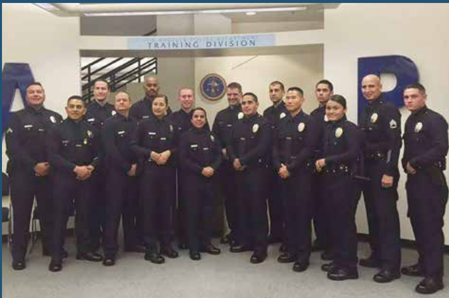
The graduates of Reserve Recruit Class 9-15R. Welcome to the LAPD family!